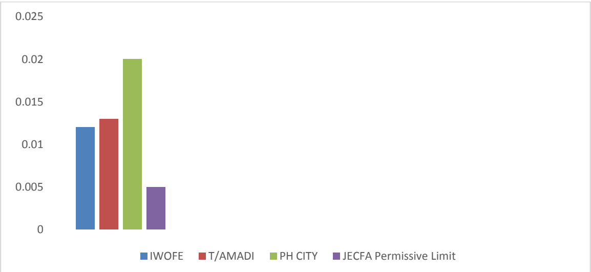
Figure 2: Total Mean Concentration of PAH (mg/kg) in Roasted Beef (Suya)

This research reveals the presence of PAHs in both raw beef and roasted beef (Suya), stating that PAHs are more concentrated in roasted beef (Suya). Generally, the samples showed readings of PAH at different levels and because these substances are known to be carcinogenic in the human body, it creates a cause for alarm in consuming such beef products. The presence of PAHs may result from burning of tyres, roasting with charcoal or wood [12-13], industrial emissions, cigarette smoking etc. The result also reveals that Port Harcourt city is more contaminated with these PAHs than Trans Amadi and Iwofe. This could be as a result of air movement circulating pollutants within the city of Port Harcourt.