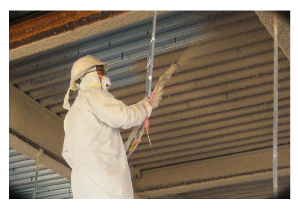
Fig. 3. Spray applied fireproofing

Hollow structural elements can be filled in order to increase the heat capacity of the element, to act as a heat sink. Figure 4 shows an example of hollow slab. Typically, they are filled with either concrete or water (Buchanan, 2001). When filled elements are exposed to fire, the heat passes through the steel and begins to heat the fillings. This method allows use of exposed steel and does not increase thickness of the structural element. As the yield strength of the heated steel column is reduced, the load is transferred to the concrete fillings. However, this method significantly increases the weight of structural elements (Buchanan, 2001).