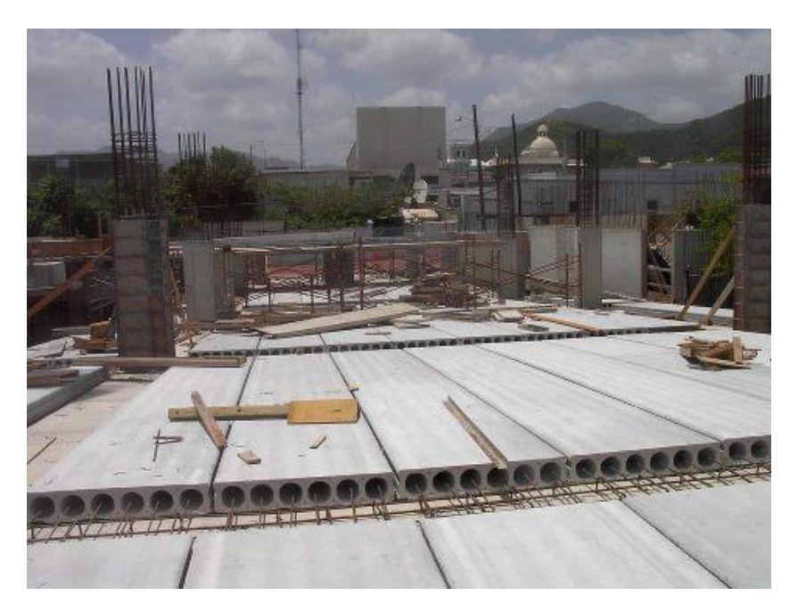
Fig. 4. Hollow slab

Hollow structural elements can be filled in order to increase the heat capacity of the element, to act as a heat sink. Figure 4 shows an example of hollow slab. Typically, they are filled with either concrete or water (Buchanan, 2001). When filled elements are exposed to fire, the heat passes through the steel and begins to heat the fillings. This method allows use of exposed steel and does not increase thickness of the structural element. As the yield strength of the heated steel column is reduced, the load is transferred to the concrete fillings. However, this method significantly increases the weight of structural elements (Buchanan, 2001).