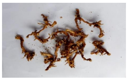
Fig. 1: Dried rhizomes of Alpinia galanga

Bagalkot. The voucher specimen (010) is kept in the Pharmacology Department at SNMC, Bagalkot.