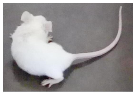
Fig. 3: Mouse showing writhing

b.w of aspirin which was considered as standard group.<sup>20</sup> Group III, IV, V received EEAGR which were considered as test groups. All the drugs were given orally (p.o). 0.6% v/v acetic acid (10ml/kg) was used to induce writhing which was prepared by adding 0.6ml of acetic acid in 100 ml of distilled water. The solution was prepared freshly before each experiment. After 1 hour of administration of standard drug and extract, 1ml/100gm body weight of 0.6% acetic acid was given intraperitoneally (i.p) to all the mice to induce pain which was characterized by abdominal constrictions or writhings. Number of writhings were counted between 5 and 20 minutes after acetic acid injection<sup>21</sup> and the percentage of protection was calculated (Fig. 3).