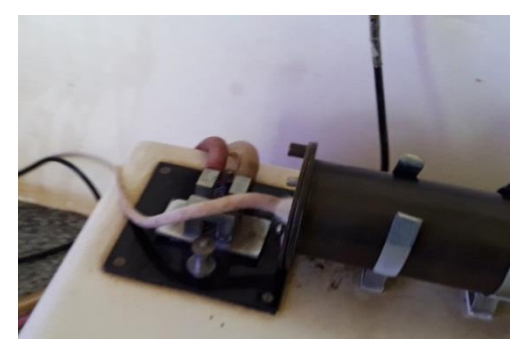
Fig. 2: Rat showing tail flick response