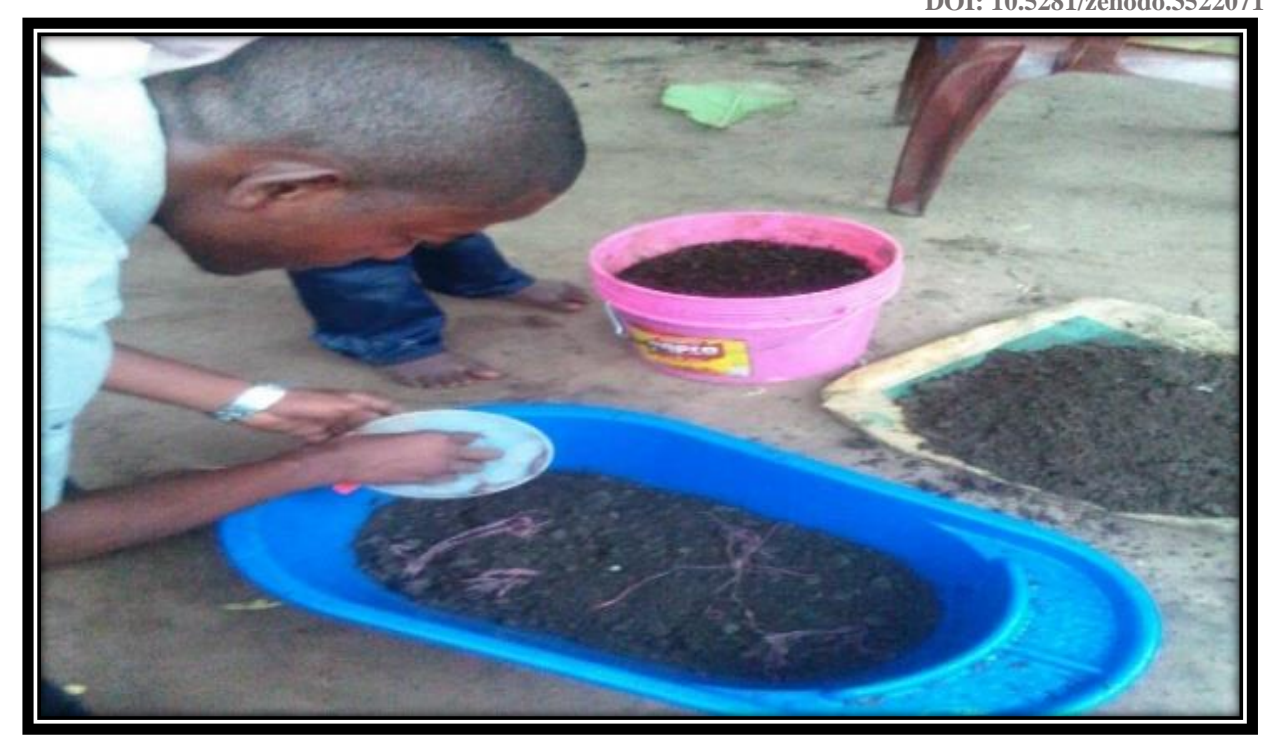
Face 9: Inoculation of 75g of the toward earth