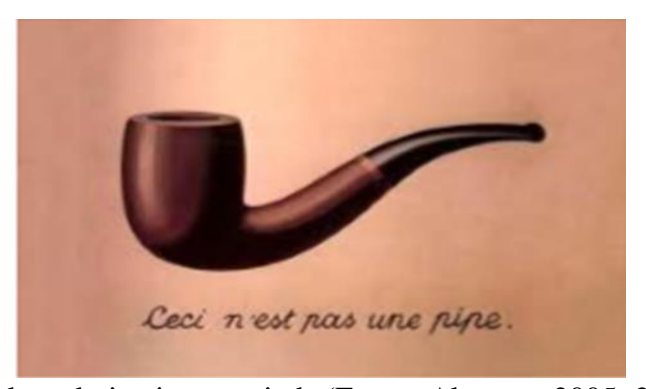
Figure 1: Indicators that evoke apple and pipe in our minds (Erman Akerson, 2005: 21)