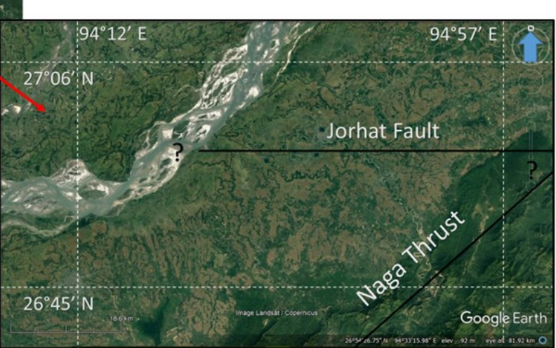
Figure 1 | Location map for Nazira-Naginimora area of Assam-Nagaland.

River Dikhow. It is located at 26.92°N 94.73°E. It has an average elevation of 132 meters (433 ft.). Naginimora is a town in Nagaland located at 26.48° N 94.48°E. It shares border with Assam. The location of field study is confined to the Nazira-Simoluguri-Naginimora road section located in the Sibsagar district of Assam and Mon district of Nagaland. The study area is bounded by 26°40' N and 27°00' N latitudes and 94°40' E and 95°00' E. The area under study is included in the Survey of India of the year 1975 toposheet no. 83 I/8, 83 I/12,83 J/5,83J/6,83 J/7,83J/9,83 J/10,83 J/11,83 J/13,83 J/14,83 J/15,83 N/1,83 N/2 and 83 N/3 of 1:50,000 scale.