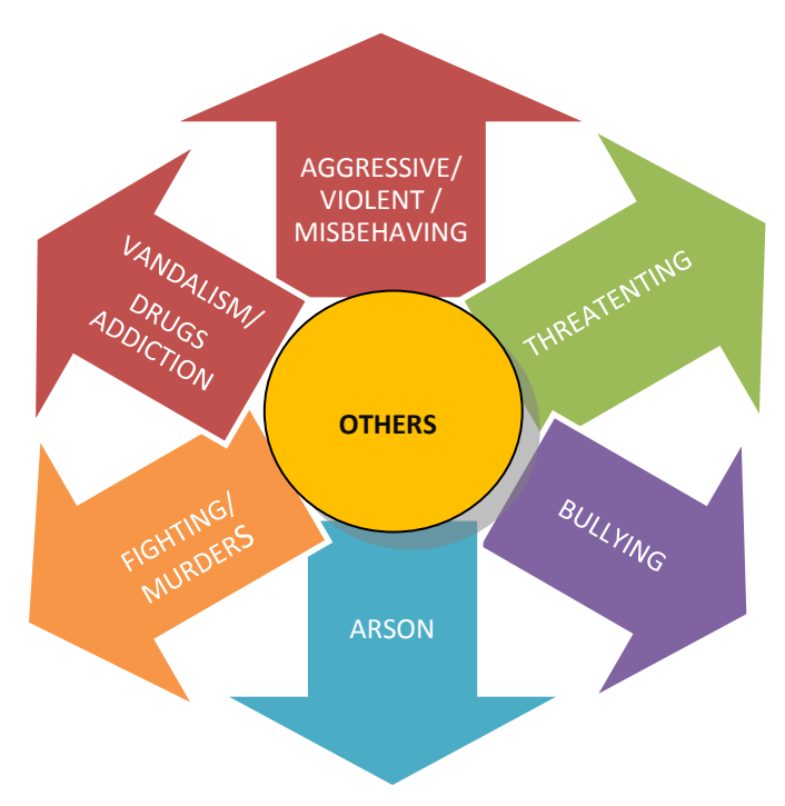
Fig 2: Externalizing Behaviors

The problem behaviors which are directed toward others are termed as externalizing behavior. When a teacher notices that some of the class students has been showing certain behavioral inconsistencies like refusal to complete classroom assignments, disturbing other class-mates, disrupt or misbehave with teachers and students during classroom hours, breaking the furniture of classroom, disobeying rules, physical aggression, threatening, bullying and fighting with others etc. then it predicts externalizing behaviors in children. Since these behaviors are directed towards the external environment therefore often referred as externalizing behaviors. Instead of expressing their negative emotions or repose to life pressure in a healthy or productive way children with externalizing behavior reflect their feelings outward to other people or things through verbal or non verbal modes. For example a child who is trouble comprehending school work may choose to bully classmate who is doing good in school.