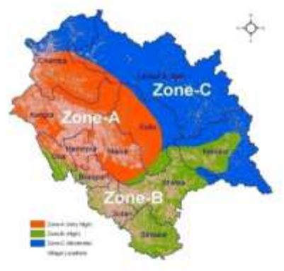
Valnerability & Risk Zones of Himachal Pradesh (Villages)

VulnerabilityZones: Vulnerability and risk zones wise whole state can be divided in three zones i.e. Zone-A, Zone- B, Zone-C. Chamba city includes in Zone-A, as depicted in the figure which is highly vulnerable from disaster point of view. Changing climatic conditions make it more vulnerable and needs to be addressed immediately with effective