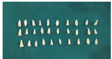
Fig 1. Thirty Extracted Anterior Initial Root Canal Treatment:

Selection of teeth: thirty maxillary central and lateral incisors with mature root apices and single canal extracted for periodontal reasons were used. Teeth with root caries, cracks on the root surface, curved roots and extremely calcified canals were excluded. Soft tissue and calculus were removed mechanically from the root surface.