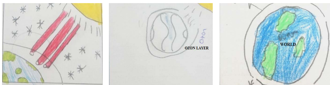
Figure 4. The drawing of P37, P30 and P11.

Besides, it was seen that the students' perception on the presence of a connection of the depletion of the ozone layer with climate control and global warming was quite high (11.6% and they made drawings about the depletion of ozone layer. There were drawings about the use of perfume and deodorant causing global warming (4.06%).