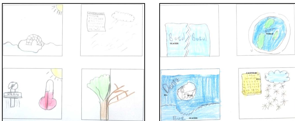
Figure 1. Example student drawings.

In the first stage, the students were asked to make four drawings about the things the “climate change and global warming” concept evoked in them. Figure 1 shows sample student drawings. In the second stage, they were asked to write down a composition by considering the drawing which was the closest to their thoughts among those made for “climate change and global warming” concept. They were ensured to state their reasons of choosing this drawing, what “climate change and global warming” concept mean in themselves and their solution suggestions for these global problems in the composition. In the third stage, focus group interviews were conducted with all students participating in the research. The focus group interviews took a week and the participants were asked to read what they wrote in the compositions and to explain what they emphasized about the climate change and global warming and their reasons. While conducting the interviews which lasted for approximately 20 minutes, a quiet environment was preferred and the interviews were then converted into a text and codes, categories and themes were determined.