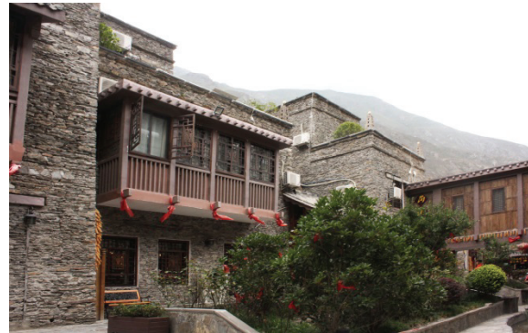
Figure 4. General plan of the Tonghua old village

Tibetan settlements in Lixian County rely on cultivated land. They are usually built in the edge of the farmland, without the occupation of the ripening soil. The settlements are in sunny base near springs, streams or rivers. Similar to the Qiang houses, the Tibetan houses in Lixian County are also called "towers". Most of them use the wall to bear the structure system. The 1st floor is for the livestock, 2nd and 3rd floor is for living and praying, and the top floor is roof terrace.