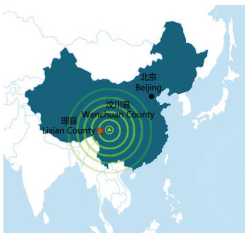
Figure 1. The location map of Lixian county

Lixian County has a population of 44,000, of which the Tibetans accounted for 52%, the Qiang people accounted for 33% and the Han people accounted for 14%. The Tibetan residents are mainly distributed in the western part of the county, and the Qiang residents are mainly distributed in the eastern part.