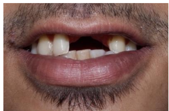
Fig. 15: Pre-treatment smile