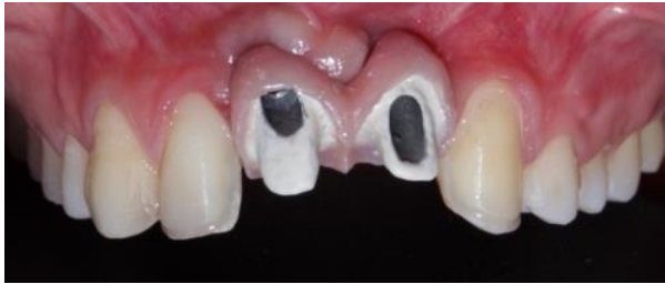
Fig. 10: Laminate preparation on 12, 23 and trial insertion of screw-retained framework

Laminate preparation on 12 and 23 was done using Gurel’s technique to ensure a conservative preparation and a final impression of the prepared teeth along with the titanium framework was made in polyether impression material (Impregum; 3M ESPE).