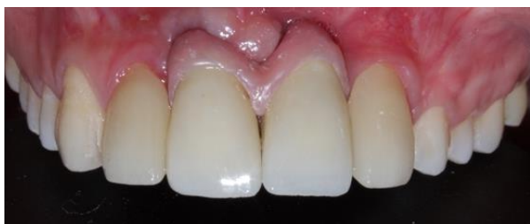
Fig. 12: Intra-oral view of definitive Paulo Malo prosthesis and laminate veneers

The zirconia crowns were cemented with a resin reinforced glass ionomer cement (Fuji Cem, GC) and the laminates with a resin cement (Calibra).