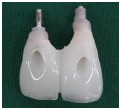
Fig. 6: Polymethyl methacrylate trial