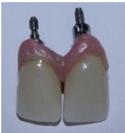
Fig. 11: Definitive prosthesis

Thereafter, the ceramic of the various parts of the definitive prosthesis were glazed. The abutment screws were tightened to a torque of 30N, followed by blockage of the screw-access hole with gutta percha and composite resin.