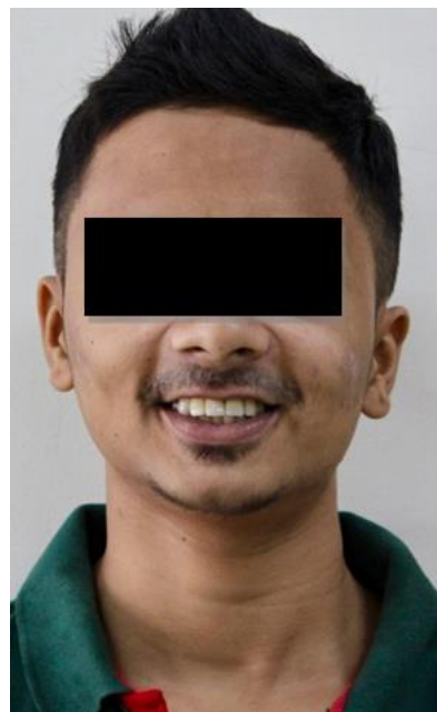
Fig. 14: Post-treatment extra-oral view