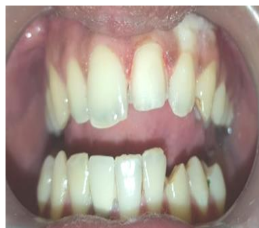
Fig. 2: Intraoral photograph showing Veneer preparation