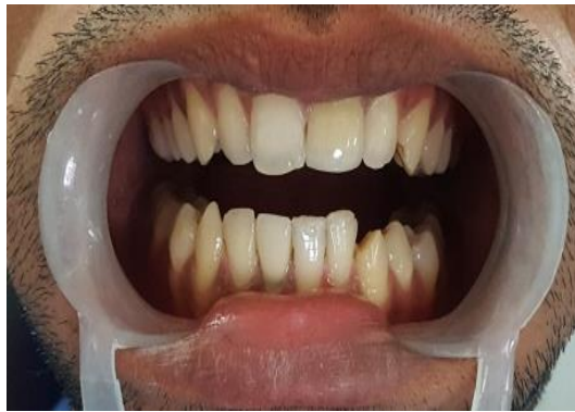
Fig. 5: Post-operative intraoral photograph showing veneer after cementation