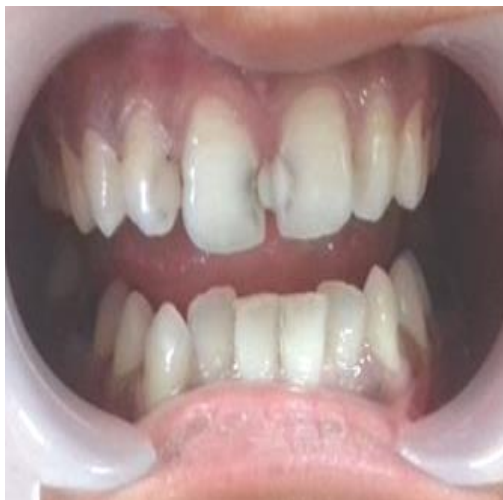
Fig. 6: Pre-operative photograph for the case 2

A 27 year old female patient reported to the department of Conservative Dentistry and Endodontics with the chief complaint of discoloured and dislodged restoration with respect to the upper front teeth. On clinical examination, the upper front teeth showed brown discrete discoloration due to previous restoration (Fig. 6). This case was similar to first case and composite restoration and ceramic veneers were planned. Veneer preparation and cementation was done as discussed earlier (Fig. 7).