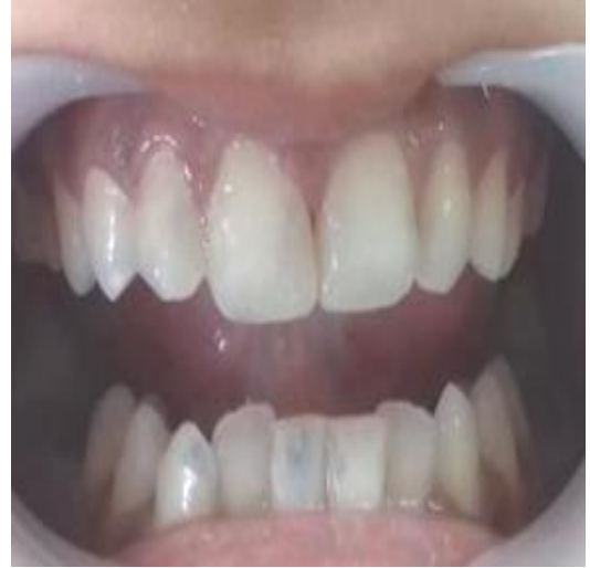
Fig. 7: Post-operative photograph for the case 2