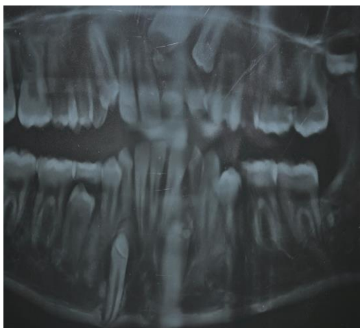
Fig. 1: OPG shows multiple impacted teeth

Correlating with the clinical and radiographic picture, the histological description of haphazard deposition of dental tissue was most consistent with the diagnosis of complex composite odontome.