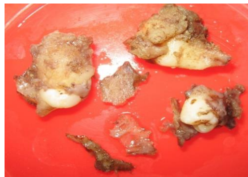
Fig. 2: Gross specimen