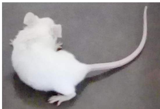
Fig. 3: Mouse showing writhing

b.w of aspirin which was considered as standard group. 20 Group III, IV, V received EEAGR which were considered as test groups. All the drugs were given orally (p.o). 0.6% v/v acetic acid (10ml/kg) was used to induce writhing which was prepared by adding 0.6ml of acetic acid in 100 ml of distilled water. The solution was prepared freshly before each experiment. After 1 hour of administration of standard drug and extract, 1ml/100gm body weight of 0.6% acetic acid was given intraperitoneally (i.p) to all the mice to induce pain which was characterized by abdominal constrictions or writhings. Number of writhings were counted between 5 and 20 minutes after acetic acid injection 21 and the percentage of protection was calculated (Fig. 3).