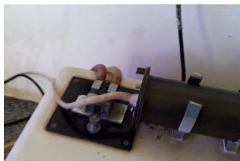
Fig. 2: Rat showing tail flick response