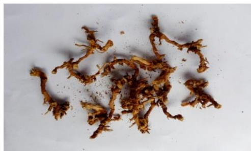
Fig. 1: Dried rhizomes of Alpinia galanga

Bagalkot. The voucher specimen (010) is kept in the Pharmacology Department at SNMC, Bagalkot.