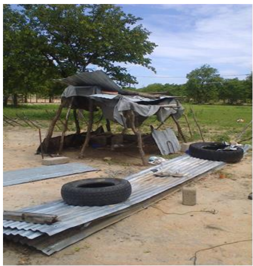
Figure 2 . Housing provided to Tswana chickens by the rearers in the study area.

in the construction of shelters. In agreement with this finding, Guéye (2005) observed that though women are the centre of poultry farming, it is the responsibility of men and boys to help women in the construction of poultry shelters.