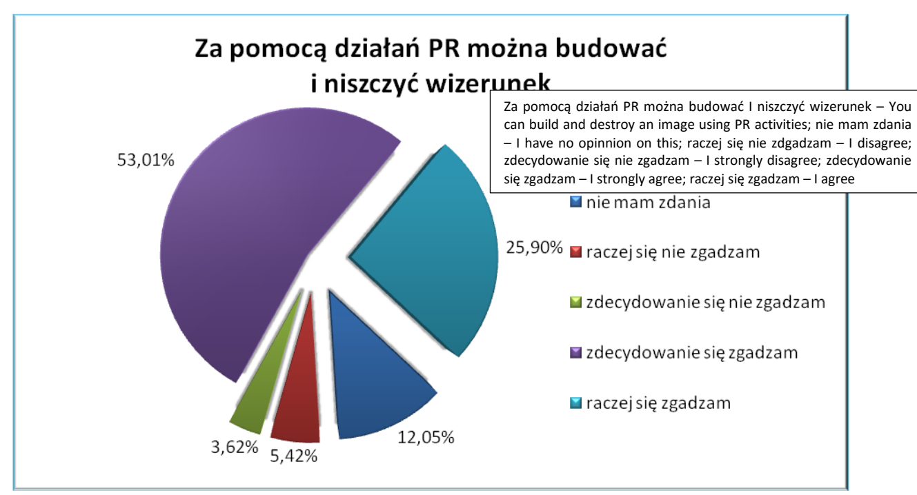
Fig. 2. Building and destroying the image with the help of PR in respondents' opinion

The surroundings of the company should be an element of the entrepreneurs' actions with respect to planning for difficulties, conflicts, or failures. The groups harmed in each crisis may be outside the enterprise's sphere or work within the company. When planning a crisis management strategy, it is always worth thinking about who this crisis may affect.