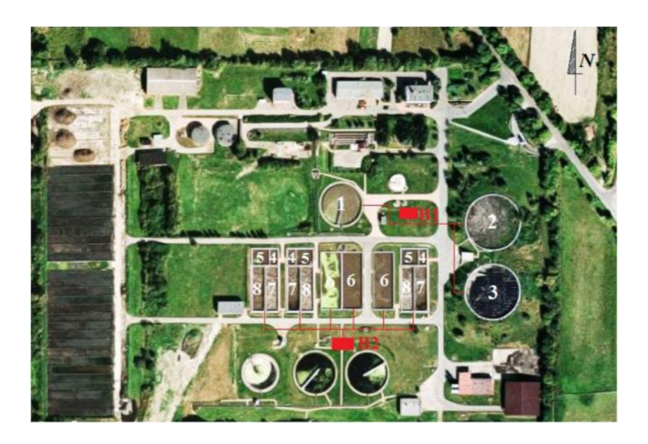
Fig. 3. The facilities of the Wastewater Treatment Plant in Belchatow have been encapsulated and proposed location of biofilters [18]:

The location of biofilters in the wastewater treatment plant is shown in Figure 3. Biofilter No. 1 is proposed to be located about 30.0 m east of the primary settling tank, while biofilter No. 2 is proposed to be located about 15.0 m south of the denitrification chambers.