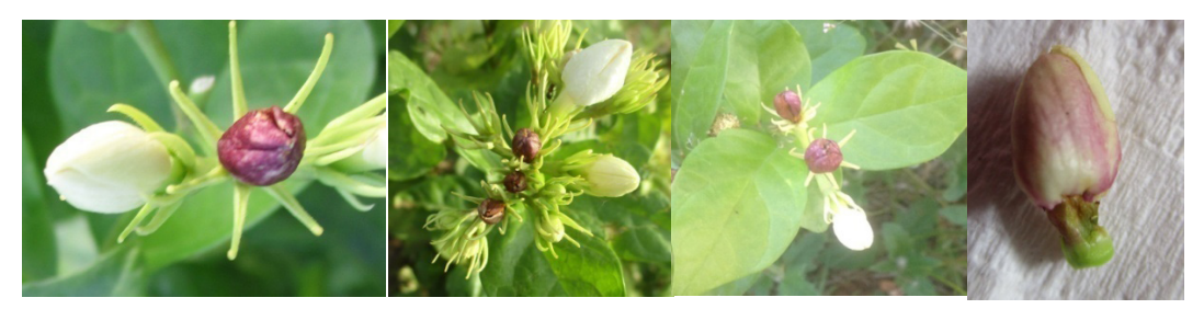
Pink discoloured buds