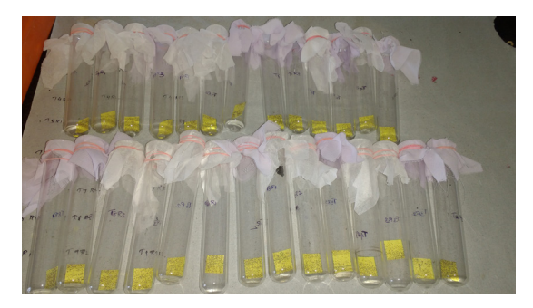
Fig. 3. Effects of neem oil nanoemulsion on the egg parasitoid, Trichogramma chilonis .

Results presented in Table 1 showed the effect of different concentrations of nanoemulsion in comparison with macroemulsion of neem oil on the percent parasitism, adult emergence and mortality of T. chilonis. All these treatments were significantly different from one another. Highest percent parasitism was observed in control (90.00%). The data showed that parasitism was significantly decreased by increasing the neem oil macroemulsion concentrations (T1-T5). On the contrary, the parasitism was significantly higher in neem oil nanoemulsion (86.00, 86.00, 80.69, 76.48, 71.69 and 66.78 in 50, 100, 500, 1000, 50000, 10000 ppm, respectively) than neem oil macroemulsion. The lowest percent adult emergence (48.45%) was recorded in the highest concentration (T6) of neem oil macro emulsion followed by 52.26, 58.80, 63.63, 69.50 and 72.25 % in T5, T4, T3 T2 and T1, respectively. Highest adult emergence (82.50 and 77.37% in neem nano and macroemulsion) was recorded in check (T6). The adult emergence was found on increasing rate by decreasing the concentrations of neem nano and macroemulsions.