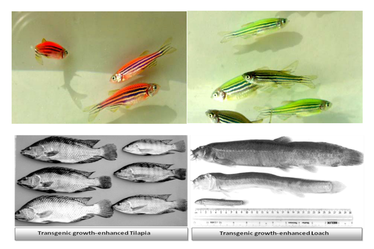
Fig. 2 Fluorescent transgenic zebra fish as new type of ornamental fish. The left picture shows three red fluorescent mylz2:RFP transgenic fish (also known as Gold Fish TM), whilst in the right three green fluorescent mylz2:GFP transgenic zebra fish and two wild type zebra fish (labelled with WT)