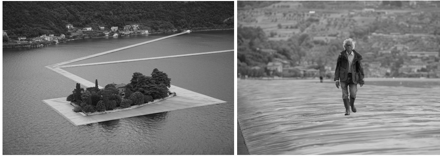
Fig. 5. “The Floating Piers” and Christo

the surface of the water (figure 5). Visitors were able experience this work of art by walking on it from Sulzano to Monte Isola and to the island of San Paolo, which was framed by The Floating Piers. The mountains surrounding the lake offered a bird's-eye view of The Floating Piers, exposing unnoticed angles and altering perspectives.