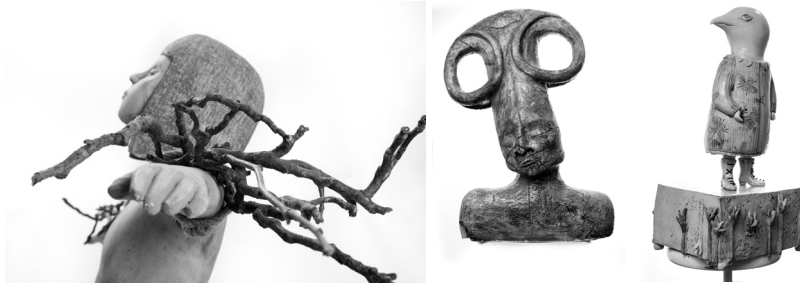
Fig. 6. An example of author's work

The advance of the technology revolution marks the start of a new era in the plastic arts. Creators reproduce faster than ever images. The available means of expression and their combinations allow for unlimited possibilities in communicating new ideas. The creation of art has never been easier and faster. Hence, we should note a new challenge for every artist – the information overload, where countless streams of signals compete for a piece of our attention. This lead to a dramatic psychological changes in our society and perceptions what is art and how we think in the modern new environment. Still, I am sure that the technology can change our lives, but will never affect the elementary principles of nature beauty and the way it is used by the human beings [4, 6].