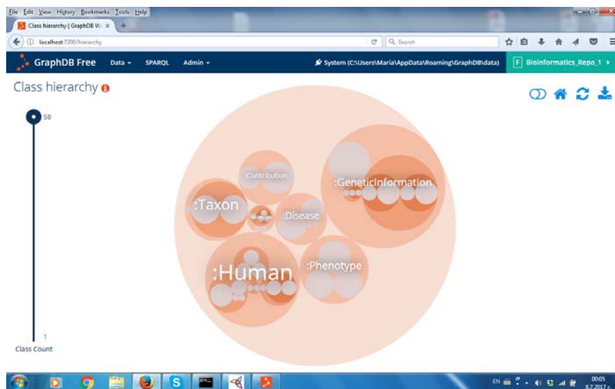
Fig. 1. Class hierarchy of BIO.

The core ontology named BIO is designed especially for the discussed project. It consists of seven interrelated sub-ontologies without formal hierarchical relations each with another (see fig. 1).