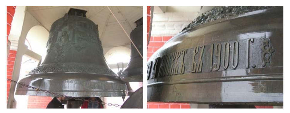
Fig. 3. Photos of the largest bell N16 of the object N9 (church "Nativity of Christ", Shipka).