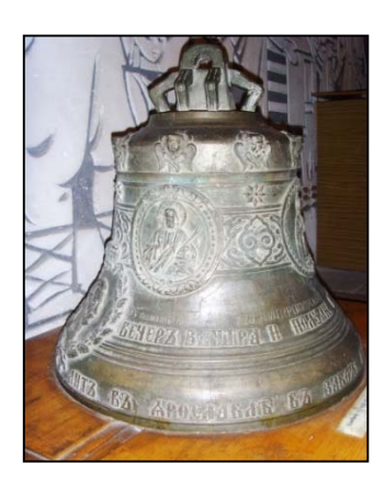
Fig. 1. Russian bells from Transfiguration Monastery; Bell № 0203, (Multimedia fund BellKnow, n.d.)