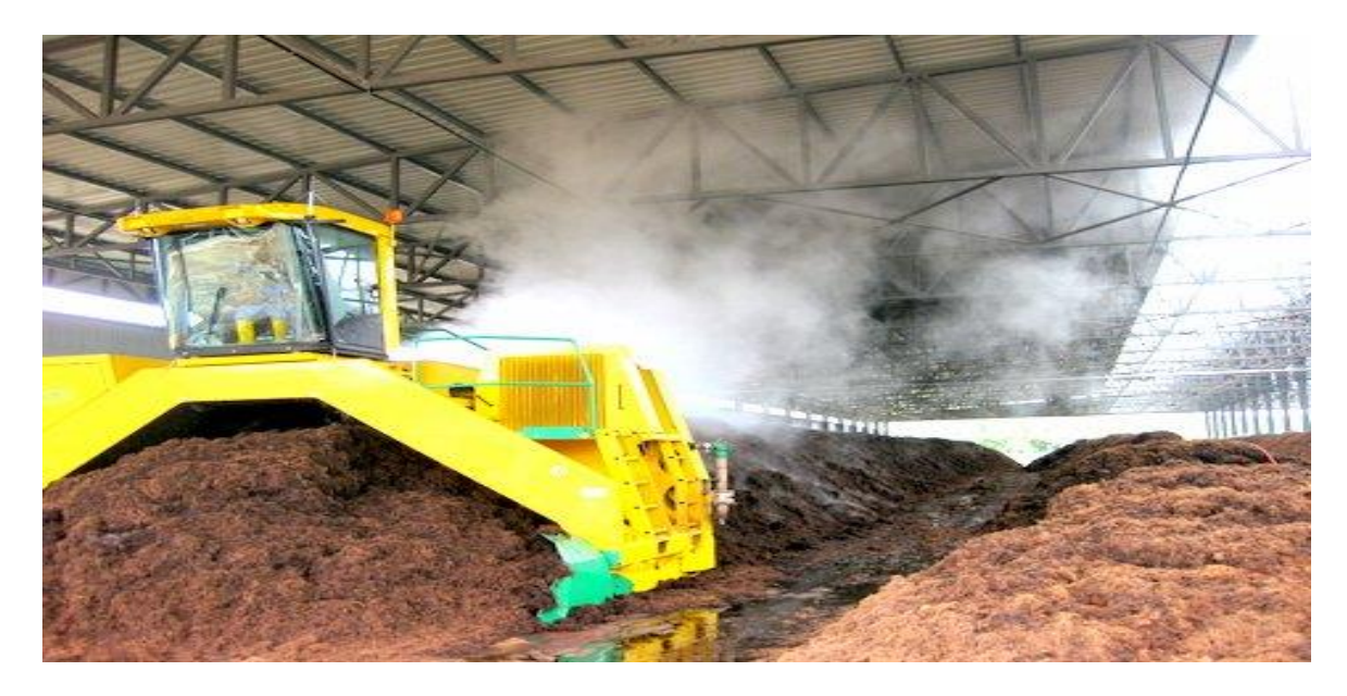
Picture 3. Turning windrows to optimize microstructure, O<sub>2</sub> and moisture content

with tropical plants. Using zero waste discharged composting technology we can contribute to increase humus content of tropical soils by 1.4 kg humic acid, 7.2 kg organic C , 1 kg K<sub>2</sub>O, 0.4 kg P<sub>2</sub>O<sub>5</sub>, 0.2 kg MgO, 0.1 kg CaO, 0.4 g B at application rate 20 kg compost/palm oil tree/year. Also compost contain trace elements. It was established by huge area experiment (in ha Palm Oil Plantation in Sabah, Lahad Datu) that additional to mineral fertilization, the application of humic acid (imported from USA) to palm oil plantations at rate of 300 g/tree/year can increase the yield at Sabah area (Malaysia) up to 37t FFB (Fresh Fruit Bunches)/ha/1-3 years. Also it have to be taken into account that optical properties of compost humic acids which are not the same as compare to very old soil humic acids. Amount of fulvic acid in composts is also very important to soil fertility because they balanced photosynthesis processes in plants and regulate release of carbon by root system to soils and soil microorganisms. Compost have also strong bioremediation effect on heavy metals and As because it pH is near to 9 and it can increase soil pH in active zone of young roots.