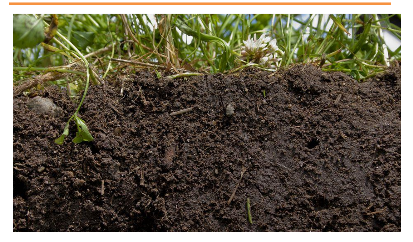
Figure 2. Soil with good fertility (<u>http://ourworld.unu.edu/en/recommended-reading-for-the-</u> un-international-year-of-soils-2015)

The most reliable tests for soil fertility are field tests (Booklet No. 353, SSS-17) but they are time consuming, laborious and expensive. Depending on the purpose they can be assessed: manures, composts, different fertilizers, water consumption and way of irrigation, breeding trials etc. Important steps to carry out such experiments are: site selection, layout, cultural operation, test phases, qualitative determination, quantitative determination, complex fertilizer trials, permanent manorial trials. Expected results can be plant growth, seed production, vegetative mass, swiftness of the fruits and their yield, appearance, how early yield will be available to the market, profitability etc.