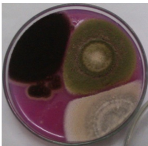
Figure 2. Fungal colonies on Rose Bengal Agar medium