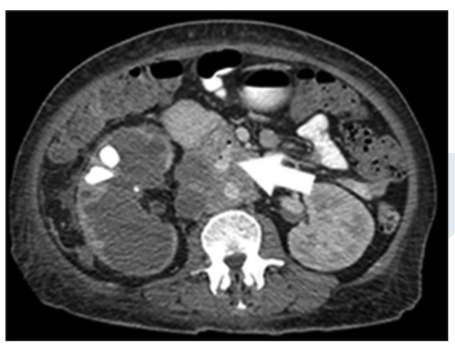
Figure 1: 44-year-old female with aortoenteric fistula. Contrast enhanced arterial phase axial computed tomography demonstrates tumor encasing the inferior vena cava and aorta. There is contrast and air extending between the duodenum and aorta consistent with an aortoenteric fistula (white arrow).

After arterial access was obtained, a flush catheter was used to perform an infrarenal aortogram (Figure 2). This demonstrated active contrast extravasation from the infrarenal