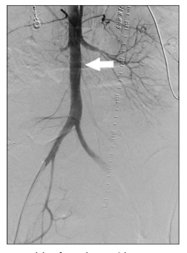
Figure 4: 44-year-old female with aortoenteric fistula. Aortogram post graft (white arrow) placement demonstrates adequate control of the fistula with no further extravasation.