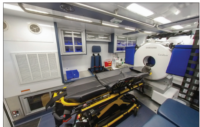
Figure 1: A standard interior of a mobile stroke unit. Note the presence of standard ambulance equipment, a computed tomography scanner, and point-of-care laboratory equipment.

As has been discussed, stroke care is extremely time sensitive, lending itself to the mantra, “time is brain.” Once