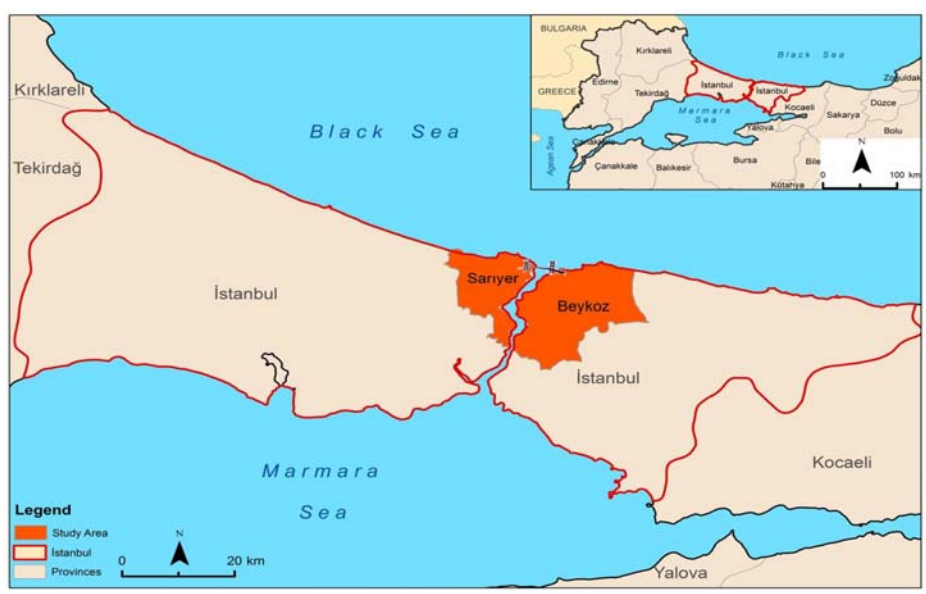
Fig 1. The location of the study area

region consisting of forests, green areas, basins, agricultural land and wetlands which are has biosphere reserve potential (Gazioğlu, et al., 1997; Simav et al., 2015). Among the areas facing ecological disintegration are municapalities where risk levels must be urgently taken into account (Burak et al., 2004; Gazioğlu et al., 2016).