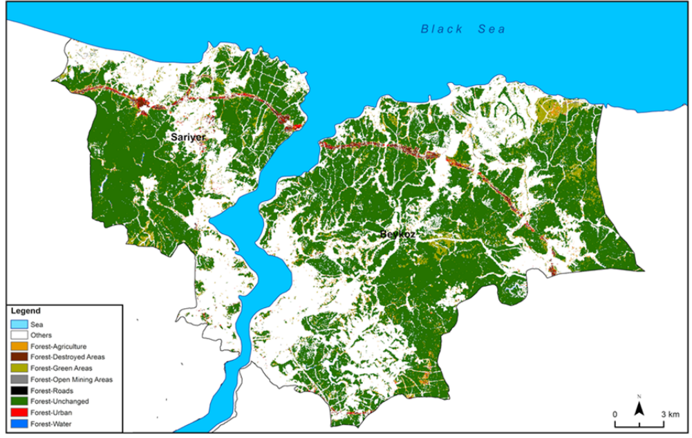
Figure 4. Forest areas in Beykoz and Sariyer Districts

using remote sensing technology. The results clearly reveal that LU/LC changes were significant during the period between 2009 and 2016. Also, Landsat classifications can be utilized to produce accurate land cover change maps and statistics that can be used to monitor the changes occurred and its impacts on the environment have been demonstrated. It can be seen that there is a significant decrease in forest, green areas density in the northern part