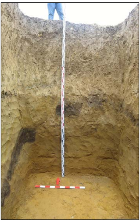
Fig 3. The Fault Line discovered in Bathonea Antique city to the west of KL.

The landslide activity on the eastern hillsides of BL, on the hillsides of Devebagirtan Valley as well as Kavaklı Creek and Haramidere valley, on the steep hillsides of Beylikdüzü and Avcılar districts facing the sea can be observed to be both static and active. Furthermore, as can be understood especially from undersea bathymetry maps and the dives performed, the landslides also take place under the sea on the coasts of Beylikdüzü and Avcılar.