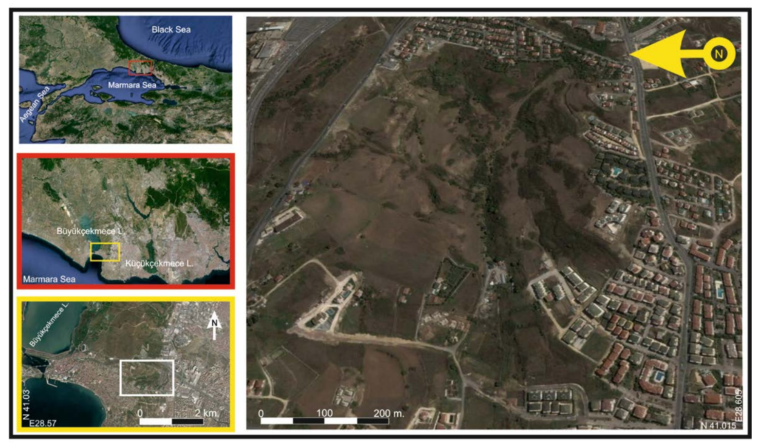
Fig 1. Study Area and Landslides of study area and Devebağırtan Valley