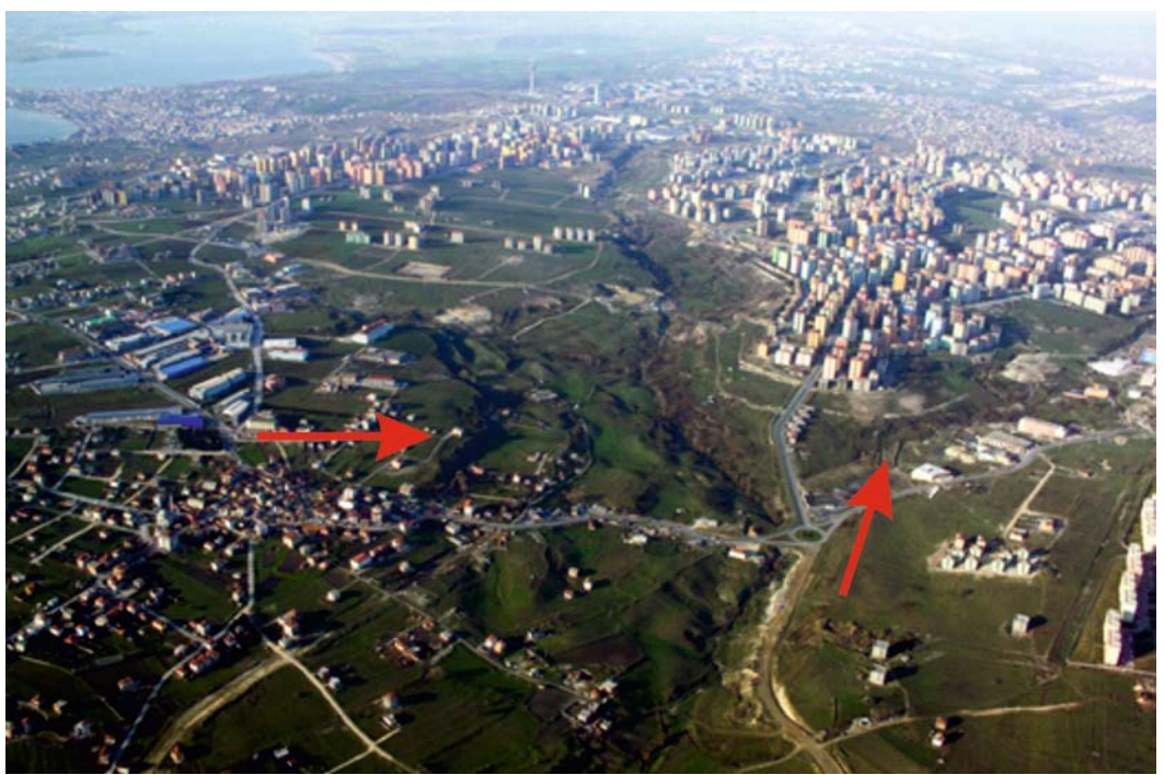
Fig 7. Landslides situated on Kavaklıdere valley (Beylikdüzü) and its branches.

landslide plane must be reduced. The measures indicated above, and similar, must be put into application after landslide classification of the area is completed. Otherwise it would not be possible to prevent serious losses and damages that may occur in the future in this area.