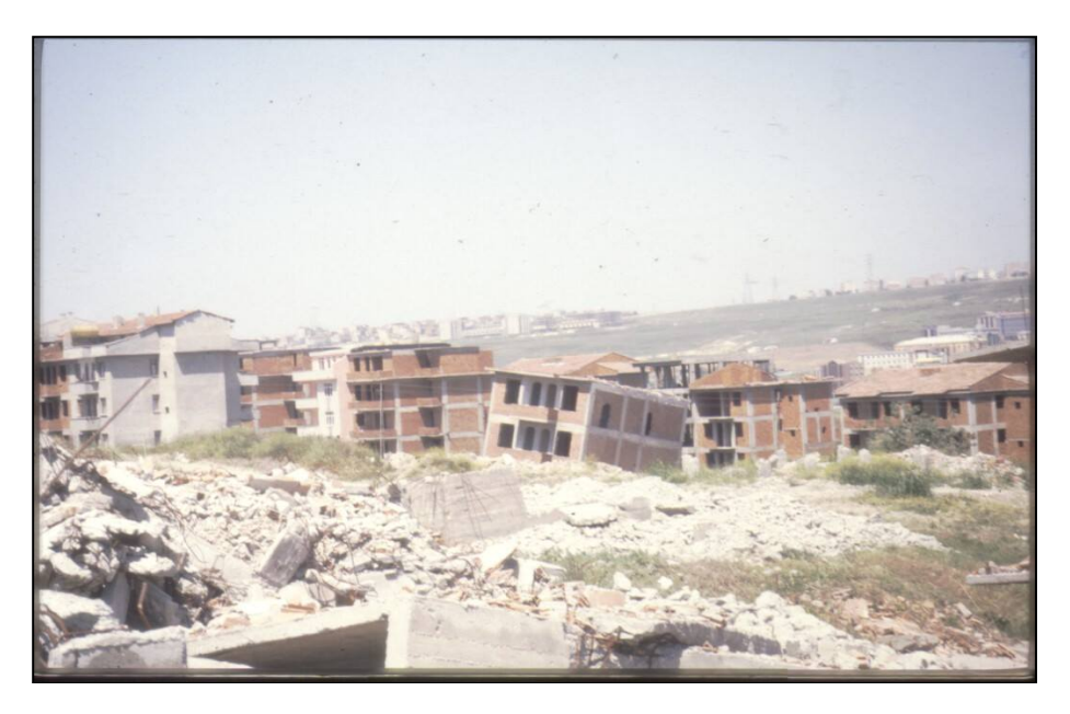
Fig 6. Damage of landslides of W part of Haramidere Valley (Yakuplu-1998)