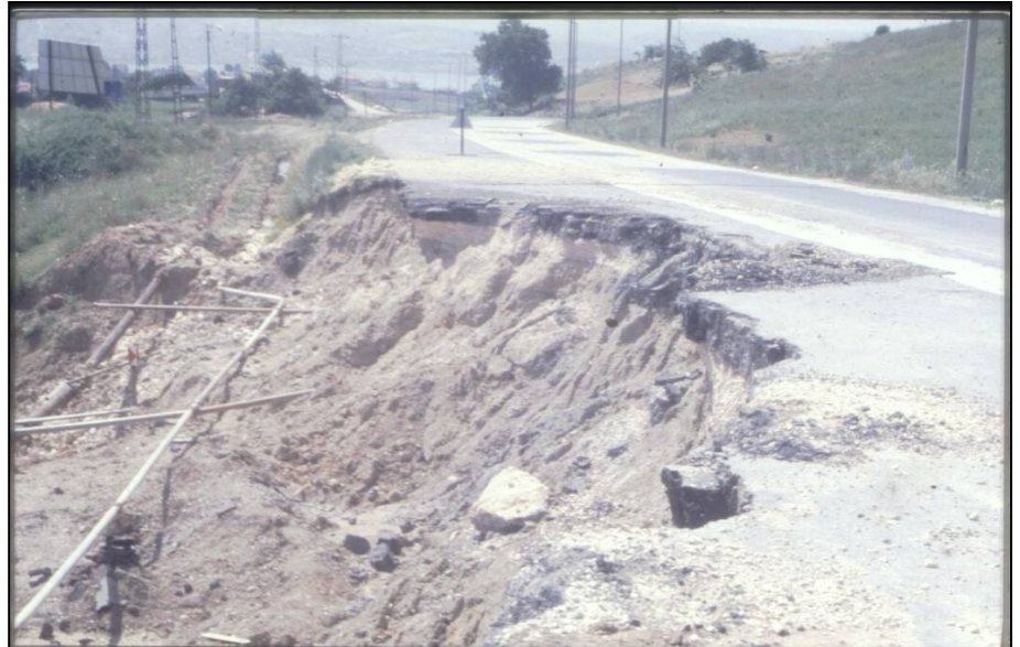
Fig 5. Landslides is suited D-100 Motorway in Devebağırtan valley N (Büyükçekmece 1998)