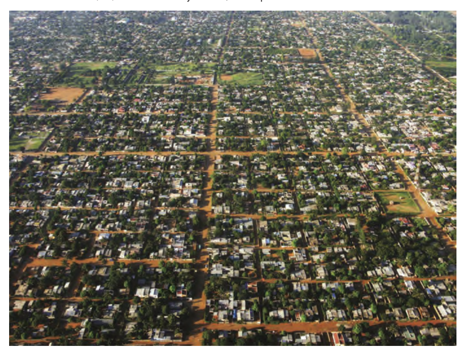
A planned suburban area with small plot sizes (12,5x25M) and some open spaces for recreation and other urban amenities. Planned in 1985 and implemented incrementally. Infrastructure provision is still rudimentary.

Almost all cases from the previous studies in 1990 and 2000 indicate significant densification evidenced in both subdivisions and extensions of existing buildings or addition of new houses as annexes