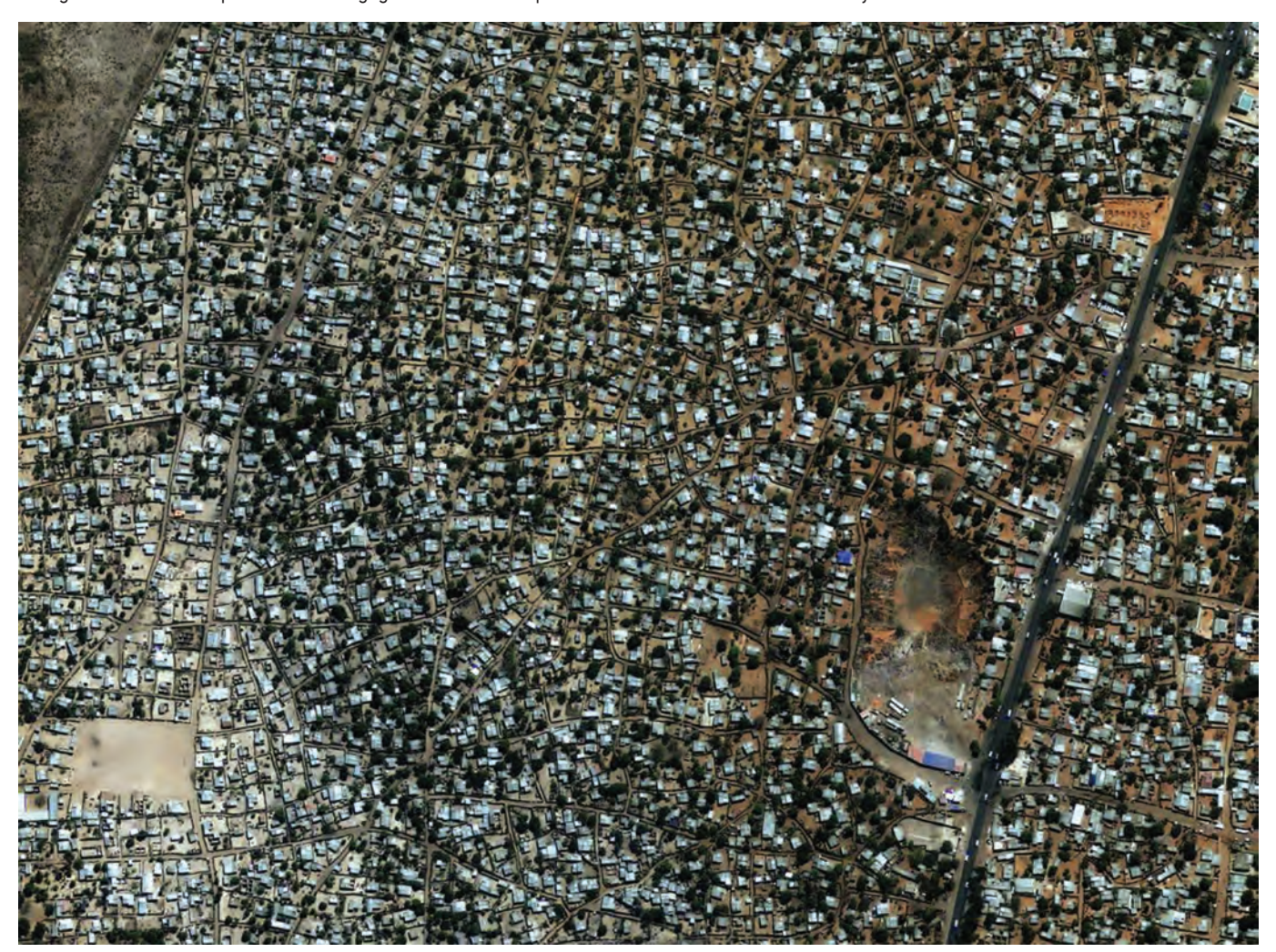
A typical informal settlement in peri-urban Maputo. Albeit the obvious spontaneous patterns and lack of proper infrastructure provision such areas constitutes homes for millions of people in many African cites, and hence the issue of formality vs. informality is not at stake for these residents; this is simply their urban environments notwithstanding all the shortcomings, and this is where they establish families and built homes.

These actors range from small landowners subdividing family land holdings through to real estate agencies. Poor, low-income and increasingly middle- and upper middle income socioeconomic groups all invest enormous proportions of their household economies in house construction and home making – the single largest national domestic source of saving – virtually without engaging formal financial institutions or the state in any way. The study consequently attempts to respond to the following research question: Who plans and built the African City?