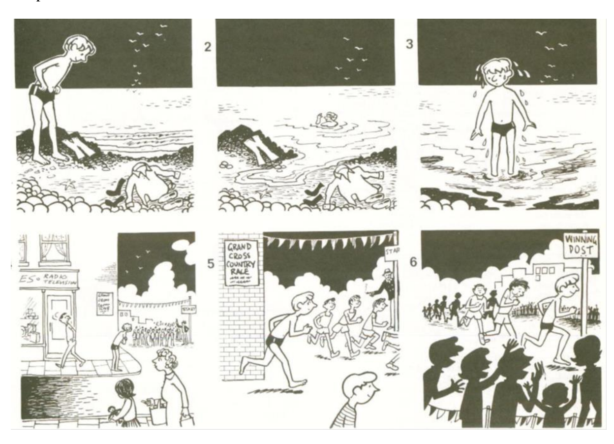
Adapted from "beginning composition thorough picture" by Heaton