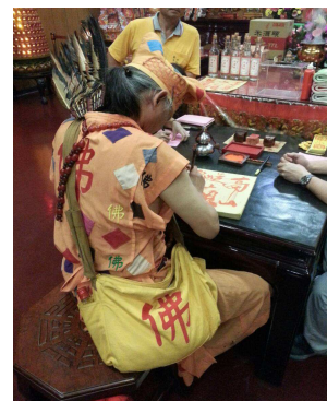
Figure 2 An altar servant