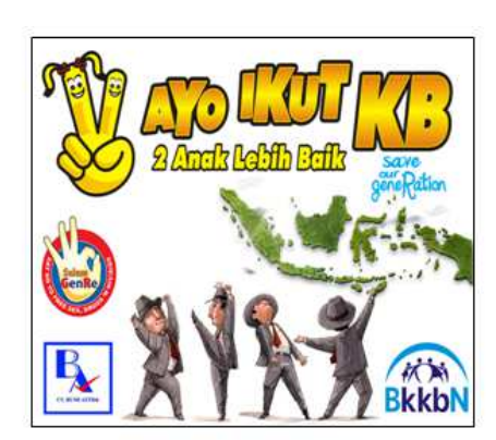
Figure 1 Figure 2 Figure 3

The analysis of this study is projected to answer three research questions proposed, namely; (1) what is the lexical meaning of the jargon text chosen by BkkbN by using jargon identification, (2) what is the ideological representation in the jargon text to the society by using social cognition analysis, (3) what does BkkbN want to communicate about the family planning program (KB) that analyzed using triadic structures formulated by Peirce.