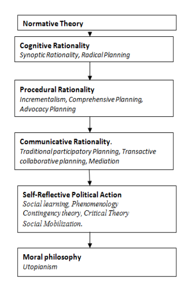
Figure 1: Gravitations in the Theoretical Build-Up of Town Planning

Master planning approach became identifiable with academic training during the first four decades of the 20<sup>th</sup> century; as a response to the spatial disorganization and living deprivations that the world's rapidly industrializing cities were generating. It emerged when there were strains of urban and anti-urban ideologies competing for dominance; as the explanations of the plight confronting cities in the late 19<sup>th</sup> and the early 20<sup>th</sup> centuries.