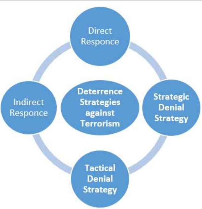
Fig. 3: Strategies for terrorists and their facilitators

The terrorists and their facilitators, near –peer and donors can be deal through some strategies mentioned in the Fig. 3