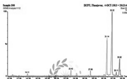
Fig 1- The GC-MS chromatogram of ethanolic extract of C. retusa