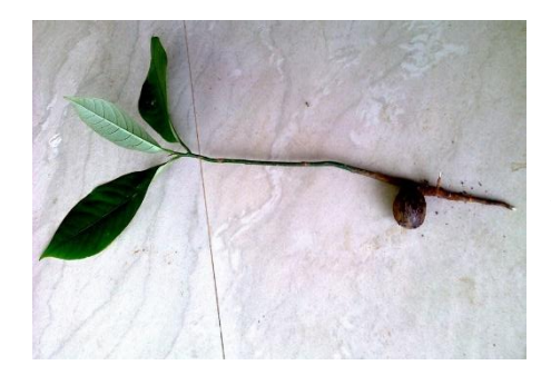
Figure 3: Genesis of a nutmeg plant from its seeds and differentiated - into shoot and root systems to become an adult tree.