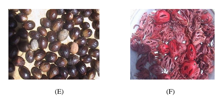
Figure 1: A ripen nutmeg whole fruit in its natural habitat which spitted into half (A), one half of mesocarp with embedded mace and nutmeg (B), mace and nutmeg separated (C), oil seed inside seed coat (D) nutmeg and mace kept for drying (E) and (F)