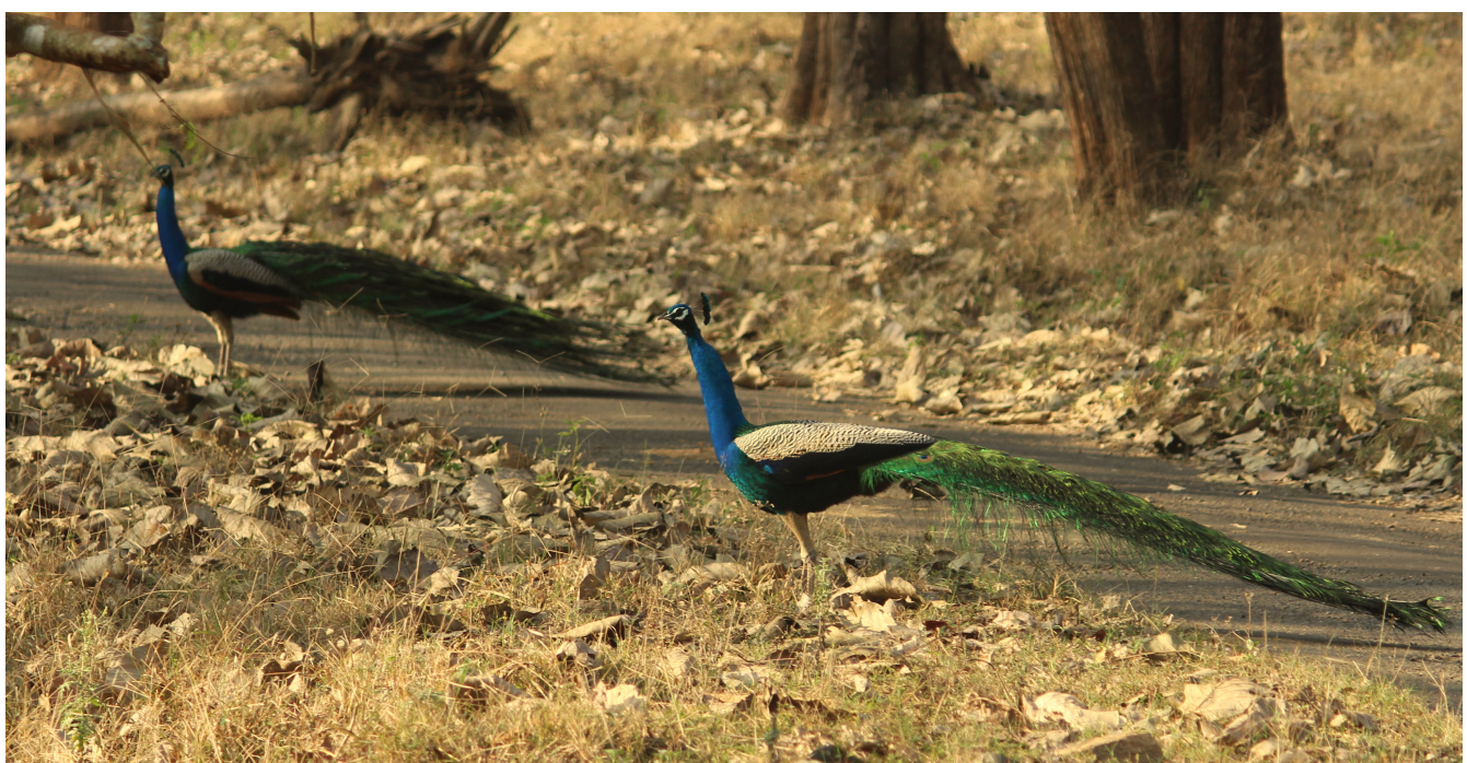
Fig. 2. Individuals of Pavo cristatus Linnaeus, 1758.

agricultural field due to Indian peafowl damages, on the other hand, a considerable number of farmers (n = 10) accepts it is a natural one. It is interesting to note that all farmers are welfare for the Indian peafowl conservation in this region. The study results of the Indian peafowl conservation mindset on drivers in Sigur Plateau show that the drivers have good knowledge about the Indian peafowl conservation and drivers (n = 25) replied that under some circumstances the Indian peafowl are victims of road kills due to its sudden appearance on the roads.