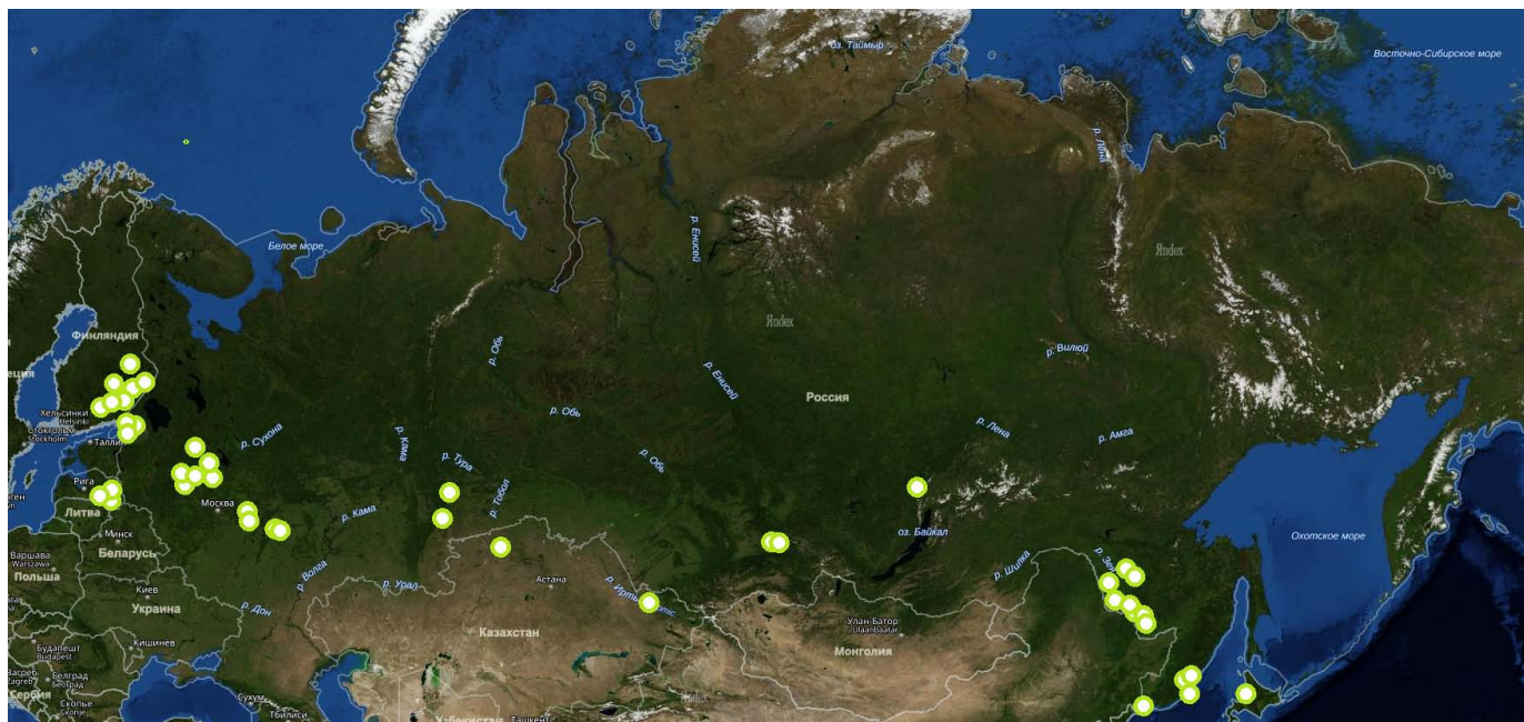
Fig. 2. Map of the current distribution of Najas tenuissima .

Single locations of the species are known in the north-west of Russia, in Central Russia, in the Southern Urals, in Eastern Siberia, in the Far East. The species is known from the Russian Far East – in the Amur region and south of Primorsky Krai.