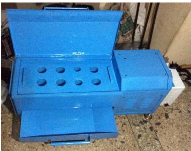
Plate 1: Tomato Slicer

up in the vertical columns. The blades cut the fruits on metal plate by shearing action. One of the blades slices the fruits during forward strokes while the other slices during backward strokes. The sliced tomatoes are moved to the collection tray by sweeping action of the flange below the blades. The next sets of tomato fruits in the column drop onto the metal plate and the process is repeated.