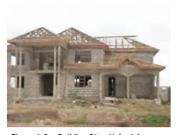
Figure A.3 – Building Sites Yola, Adamawa