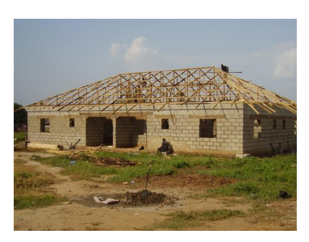
Figure A.2 – Building sites in Gombe