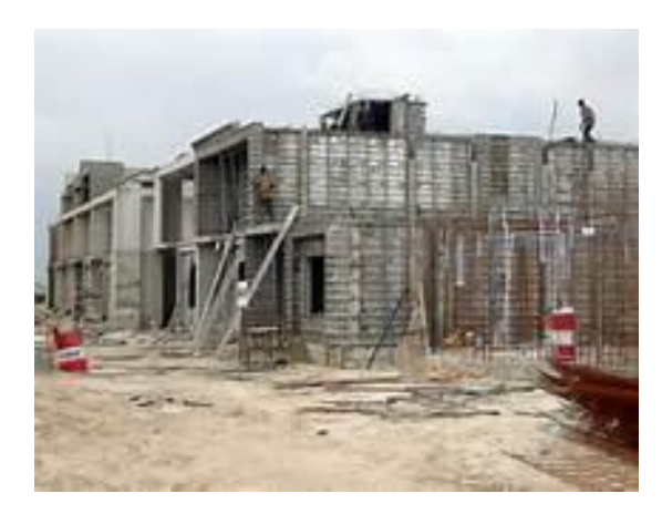
Figure A.1 – Building sites in Bauchi