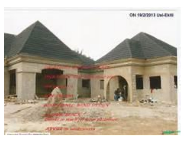
Figure A.4 - Building Site in Damaturu, Yobe State