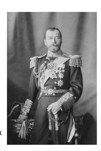
Fig. 2. Emperor Nicholas II: a – at the end of the XIX century, b – at the beginning of the XX century, c- In the 1910's.