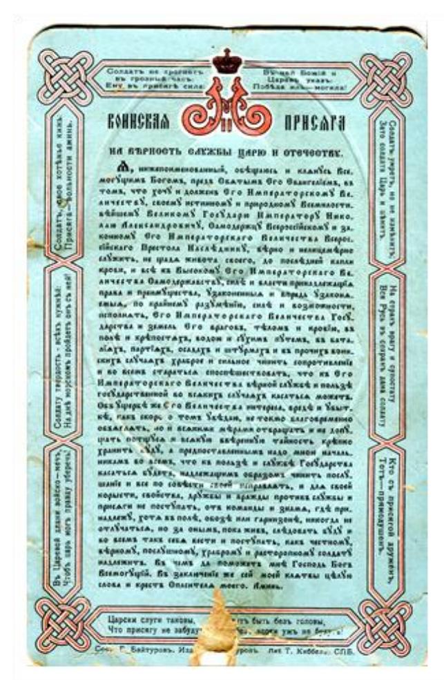
Fig. 1. "Soldier's greetings" lubok print.

The methodological basis of the research was the traditional historiography principles of historicism, scientific objectivity and systematic. Methods of working with historical sources, as well as internal and external criticism, have been used.