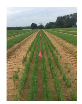
ARTICLE INFO Research Article