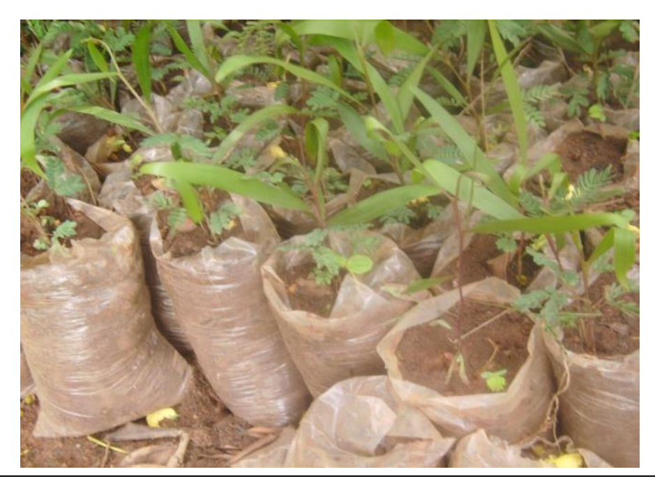
Figure 3. One month Acacia auriculiformis seedlings in a village nursery.