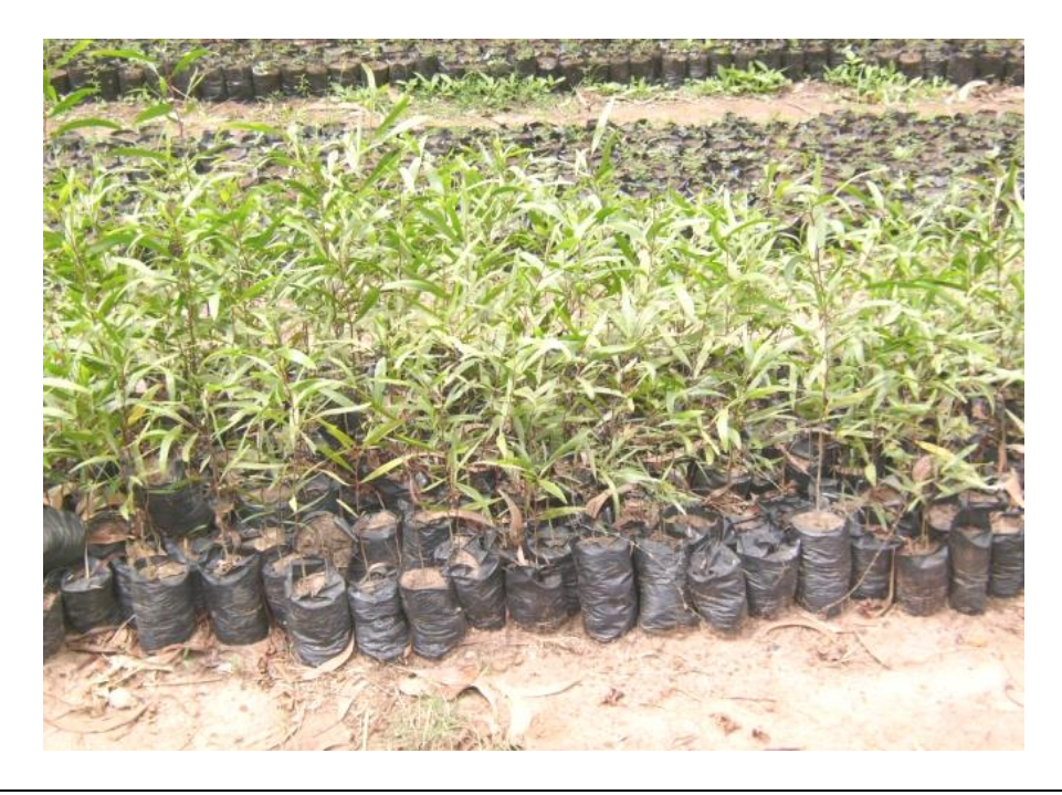
Figure 2. Three months Acacia auriculiformis Seedlings in a village nursery.

bags (figure 2) which constitute an adaptation made by nursery holders. The bags were filled in manually with compost. The pre-treated seeds were sown (2-3 seeds per bag) at a maximum depth of one centimeter. After germination of the seedlings, a form of shading was placed during the first two weeks to protect the young seedlings from direct sunlight.