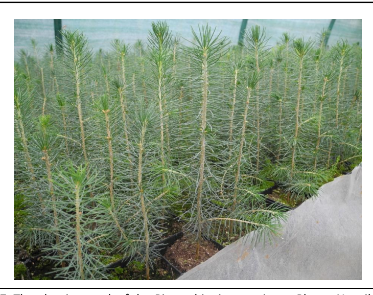
Figure 7. The planting stock of the Picea abies in containers.