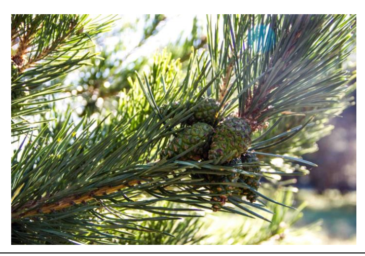
Figure 3. The cone bearing of the Pinus sylvestris "Negorelskaya".

However it should be taken into account that at the present stage it is envisaged to use one half of the planting stock, grown from seeds, which had been harvested from forest seed orchards, and the second half, grown from the seeds, harvested in the best wild stands, while establishing the forest seed orchards. Subsequently the forest seed breeding should be developing in two directions: plantation and population ones with approximately equal shares in the process of reforestation. And if in our republic the plantation seed breeding is developing, that is reflected in continuously growing volumes of the forest plantation development with the help of selective planting stock (for example, during last 10 years the share of such planting stock has increased from 11.0 % up to 40%), then the population seed breeding is not paid so much attention, largely owing to the difficulty of seed harvesting in growing forest stands. The best option is the establishment of population and clonal forest seed orchards, which are able to combine the genetic diversity of the best wild stands with the simplicity of harvesting and early fruit bearing of the conventional forest seed orchards. It is here where the reserve is hidden, which in future would allow to influence positively on productivity and quality of being restored forests without disturbing ratio between plantation and population seed breeding.