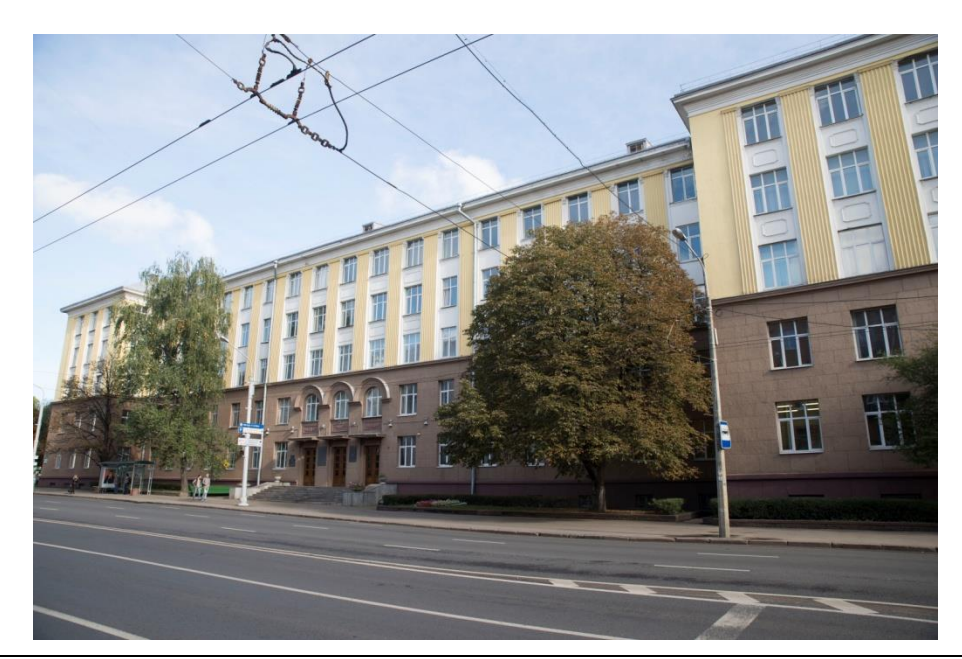
Figure 9. The oldest building of the Belarusian State Technological University (Minsk).

In Belarus the specialists in the forest management are trained by two universities - the Belarusian State Technological University (Fig. 9) and Francisk Skorina Gomel State University as well as by 4 colleges — in Polotsk, Vitebsk, Bobruisk and Gomel.