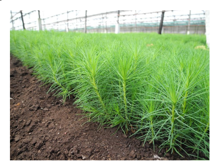
Figure 5. The one-year-old seedling of the Pinus sylvestris in the forest tree nursery of Smorgonsky experimental forestry enterprise.

The forestry enterprises actively use the technology of growing seedlings in greenhouses. In the forestry enterprises of the republic 323 greenhouses with a total area of about 14 hectares are put into operation, where up to 34.39 million seedlings were grown in 2016. In spite of difficulties as well as some lack of understanding of this technology's advantages on the part of forest workers at the initial stage, currently the volumes of seedlings, grown in the greenhouses, keep steadily growing. Over the last five years the share of participation of such planting stock has increased from 4.0% up to 12.6%, i.e. more than 3 times. The high-moor peat or the mixture of high-moor and low-moor peats are used as a substrate in the greenhouses. Predominantly one-year-old seedlings of the Pinus sylvestris (Fig. 5) or the Picea abies are being grown, however it is possible to encounter the plantings of Betula pendula and Alnus glutinosa .