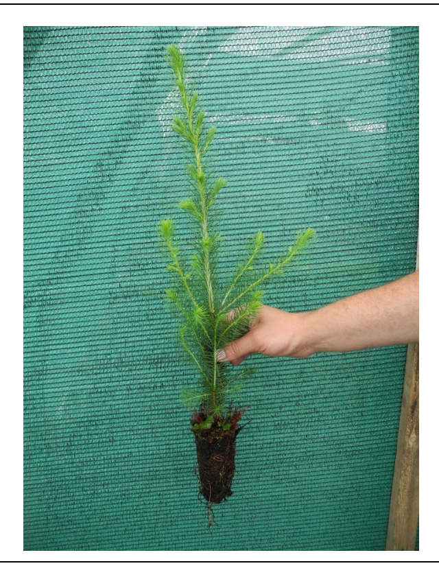
Figure 8. Two-year-old seedling of the Picea abies in container.

In 2015 "The industry program regarding growing of the planting stock with closed root system at the enterprises of the Ministry of Forestry of the Republic of Belarus for the period until 2020 year" was adopted, which provides the construction of four modern enterprises for growing of the planting stocks in containers as well as the modernization of two existing enterprises. The program envisages the gradual increase of the quantity of the planting stock, grown in containers. If in 2013 there were cultivated only about 1.5 million plants, then in 2015 there were already 5.6 million pieces, in 2016 - 10.2 million pieces, among them of Pinus sylvestris - 4.6, Picea