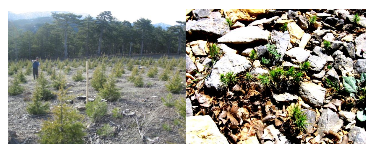
Figure 1. Forest establishment by seedling (left side) and sowing (right) in Cedrus libani.

Forest establishment can make changes for countries and regions, while it is including afforestation, reforestation /artificial regeneration, rehabilitation, erosion control, avalanche control, energy forest and rangeland improvement in Turkish forestry. It is made in order to protect soil and water resources, meet the demand of raw wood material and other functions of forests for protection purposes by planting saplings, seedling or sowing (Fig. 1). For instance, up to the end of 2010, the plantation was made on 2.060.000 hectare for wood production and on 870.000 hectare for protection purposes (<a href="www.cem.gov.tr">www.cem.gov.tr</a> 2017). Forest establishment inventory of Turkey is presented for the establishment type and years in Table 1 (<a href="www.cem.gov.tr">www.cem.gov.tr</a> 2017).