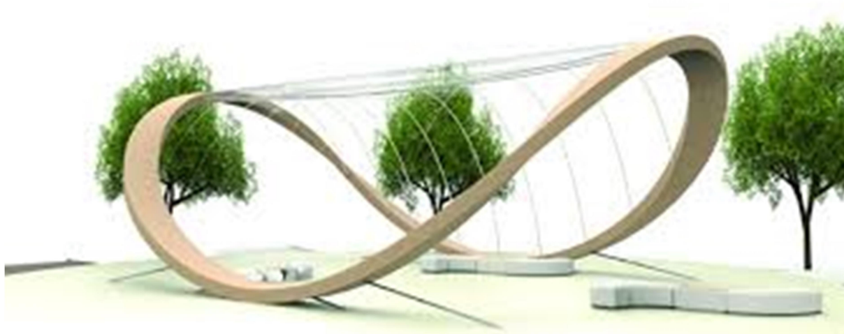
Figure 3. Industrial design in the park

Industrial design focuses on the return of an environmental standpoint. It can be shared with new communicates with the story, and to allow the past to acquire rebirth, forming a harmonious whole landscape and industrial heritage.