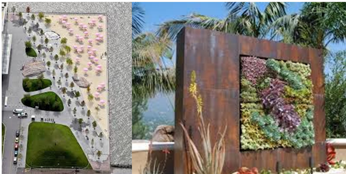
Figure 1. Industrial design

With industrial style particularly relevant in recent years, architects and designers see it as a challenge and exterior game.