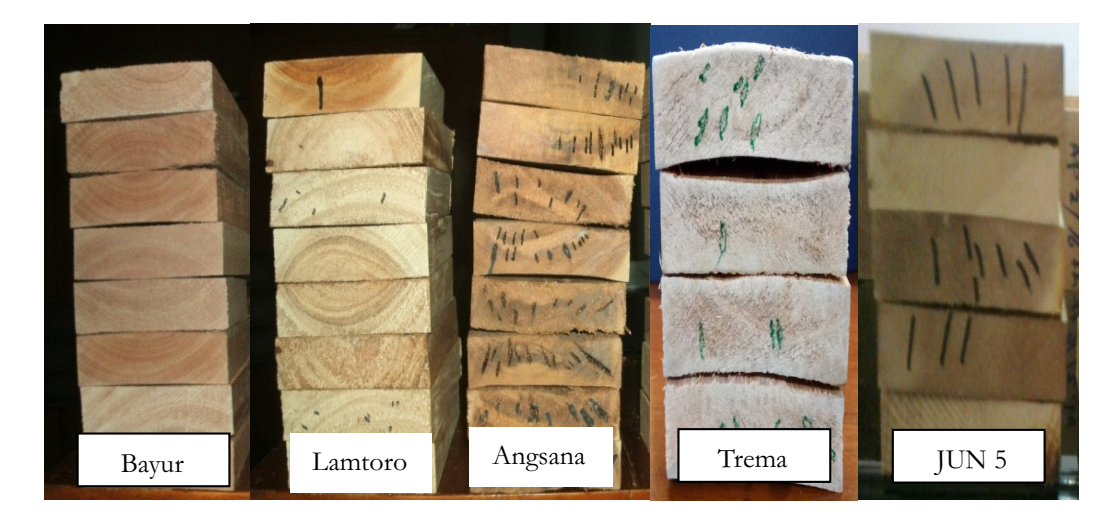
Figure 1. The honeycomb was found merely in angsana, lamtoro and fast-growing JUN teak and not in trema, bayur and jabon (picture was not taken)<sup>1</sup>

Gambar 1. Pecah dalam ditemukan pada kayu angsana, lamtoro, dan jati JUN cepat tumbuh; dan tidak dijumpai pada kayu trema, bayur, dan jabon (Foto untuk jabon tidak diambil)