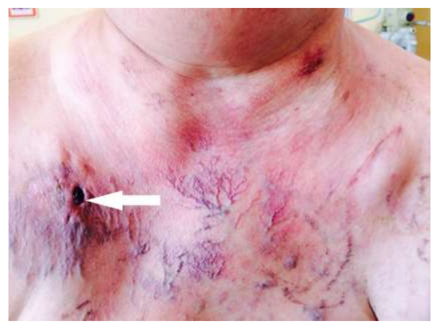
Figure 2. CVC exit site in CRT treatment in addition to anticoagulation in a 65 year old woman with breast cancer.